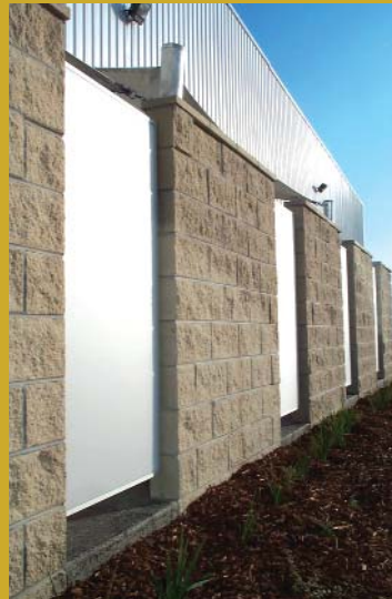
< 19 Square Polar White S2030