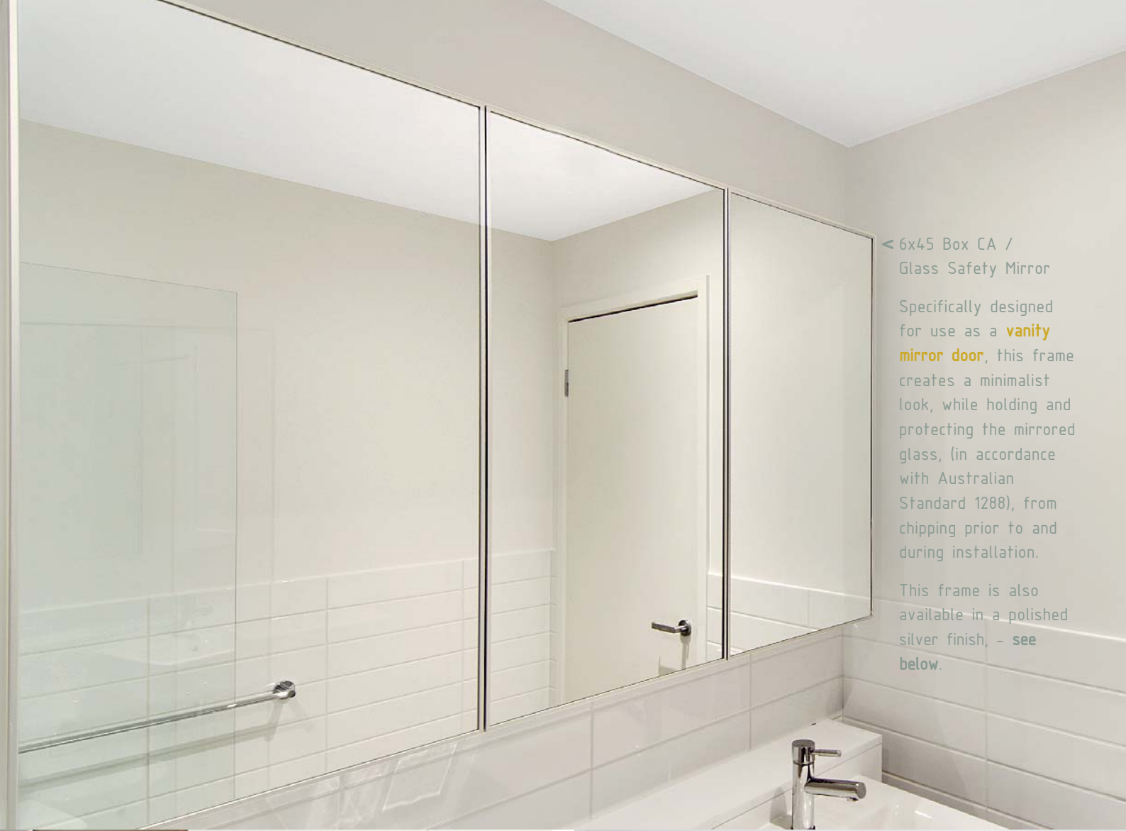
< 6x45 Box CA / Glass Safety Mirror

Specifically designed for use as a vanity mirror door , this frame creates a minimalist look, while holding and protecting the mirrored glass, (in accordance with Australian Standard 1288), from chipping prior to and during installation.