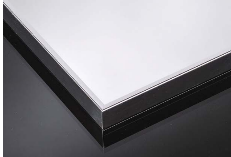
^ 6x45 Box PS / Glass Safety Mirror

Straight from Europe, this new polished silver frame, adds a bit of minimalist "bling" to your vanity mirror door .