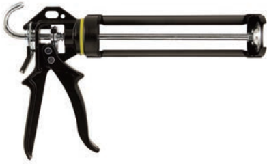
SOUDAL HEAVY DUTY CARTRIDGE GUN