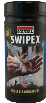
SOUDAL SWIPEX SUPER CLEANING WIPES 100 PACK