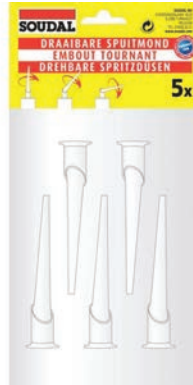
TWISTY SWIVEL NOZZLE FOR SOUDAL SILICONE ADHESIVES PACK OF 5