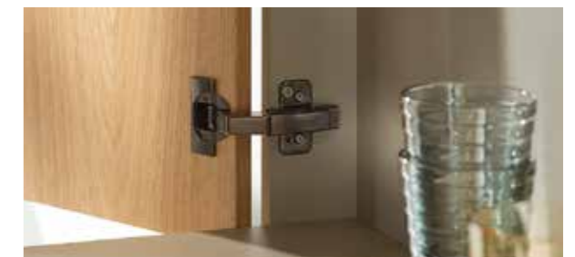
CLIP top BLUMOTION inset blind corner applications