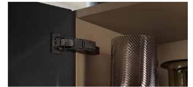
CLIP top BLUMOTION applications for thin doors

Detailed information on the awards: www.blum.com/award