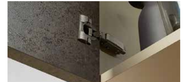
CLIP top BLUMOTION 95° profile door applications, 0-protrusion