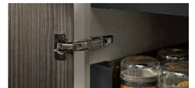
CLIP top BLUMOTION 155° wide angled applications